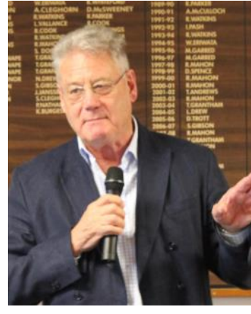
2011 - Mahe Drysdale